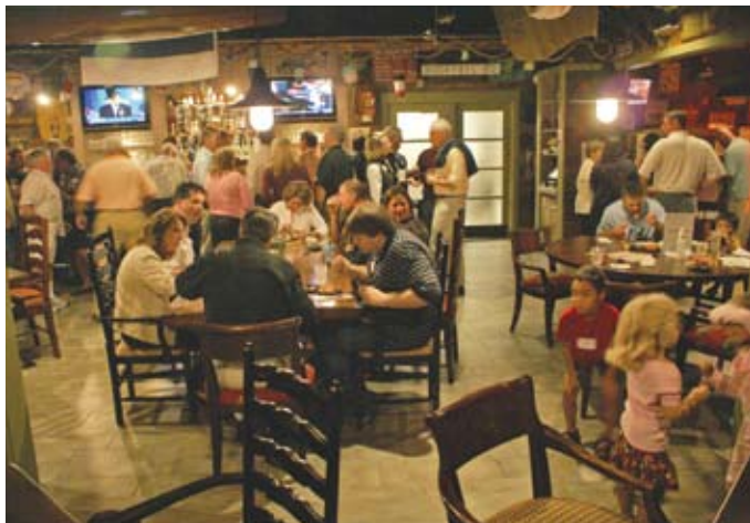
Backwater Bills is a favorite for all ages.

does most destination resorts with a full-service spa and fitness center, a themed restaurant, a sandy beach, resort-style pools, basketball, a picnic area and a general store. There are also nine miles of nature trails, a world class dog park plus tennis courts will be completed in the Spring."