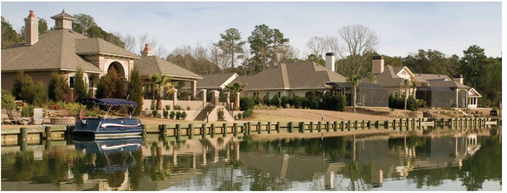
Lakefront custom "Idea Homes" have breathtaking views of the sunset.